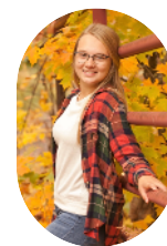
Emma G. Nursing School